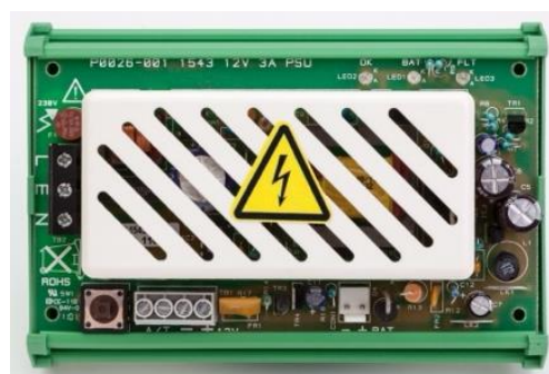
D1543 module in a DIN-rail cradle